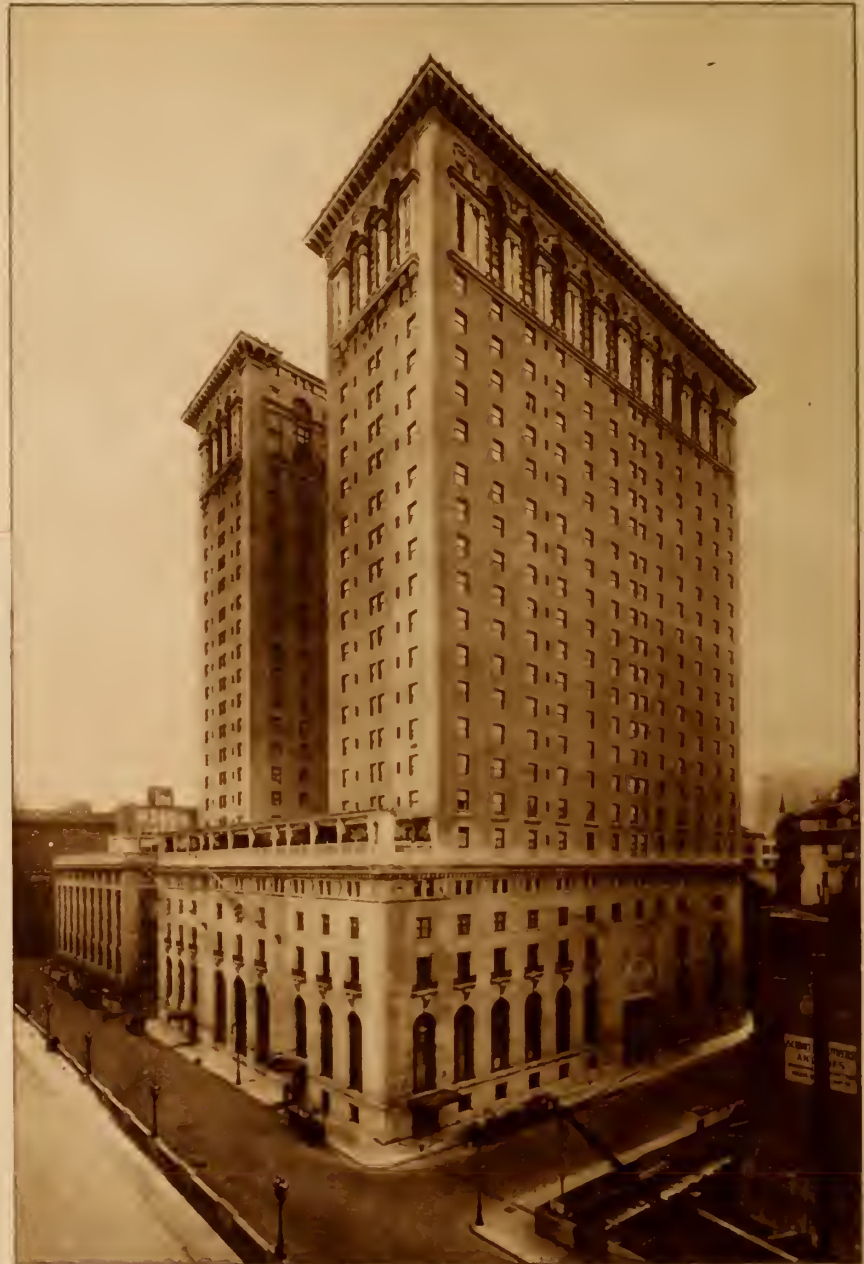
BILTMORE HOTEL, on Madison Avenue between 43d and 44th Streets. Connected underground with Grand Central Terminal. 20 stories high and contains 1000 rooms.